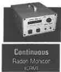
Continuous Radon Monitor (CRM)

Because of the unique nature of real estate transactions, involving multiple parties and financial interests, there are special protocols for radon testing.