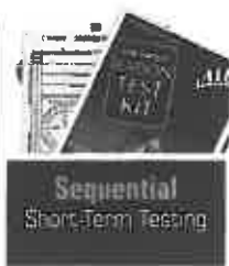
Sequential Short-term Testing

The two test results are averaged to get the radon level.