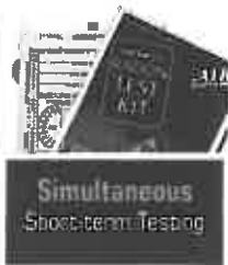
Simultaneous Short-term Testing

Test report is analyzed to ensure that it is a valid test.