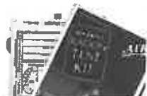
Simultaneous Short-term Testing

Test report is analyzed to ensure that it is a valid test.