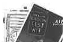
Sequential Short-term Testing

The two test results are averaged to get the radon level.