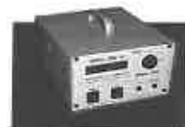
Continuous Radon Monitor (CRM)

Because of the unique nature of real estate transactions, involving multiple parties and financial interests, there are special protocols for radon testing.